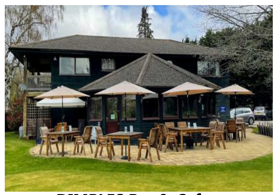
DIMPLES Bar & Cafe.