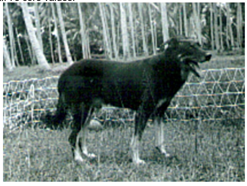
R.A.F. Police dog from the 1950's - 3952 Air Dog Hausa

The R.A.F.'s Military Working Dogs serve as invaluable assets, supporting the protection and enablement of Air and Space Power. With their extraordinary sensory abilities, they exemplify the bond between handlers and their dog companions while upholding the R.A.F.'s core values.