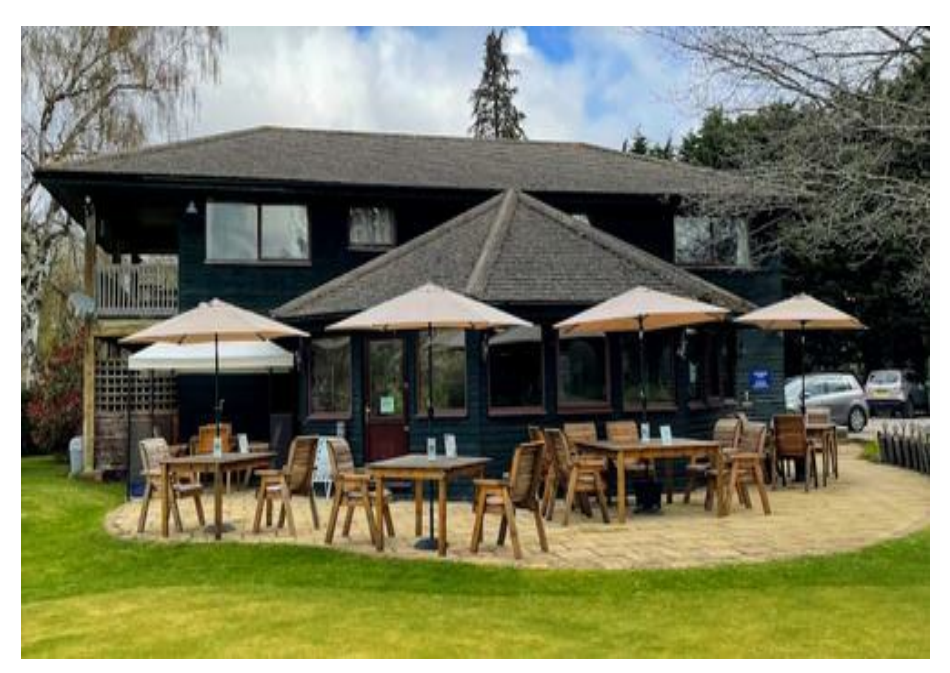
DIMPLES Bar & Cafe.