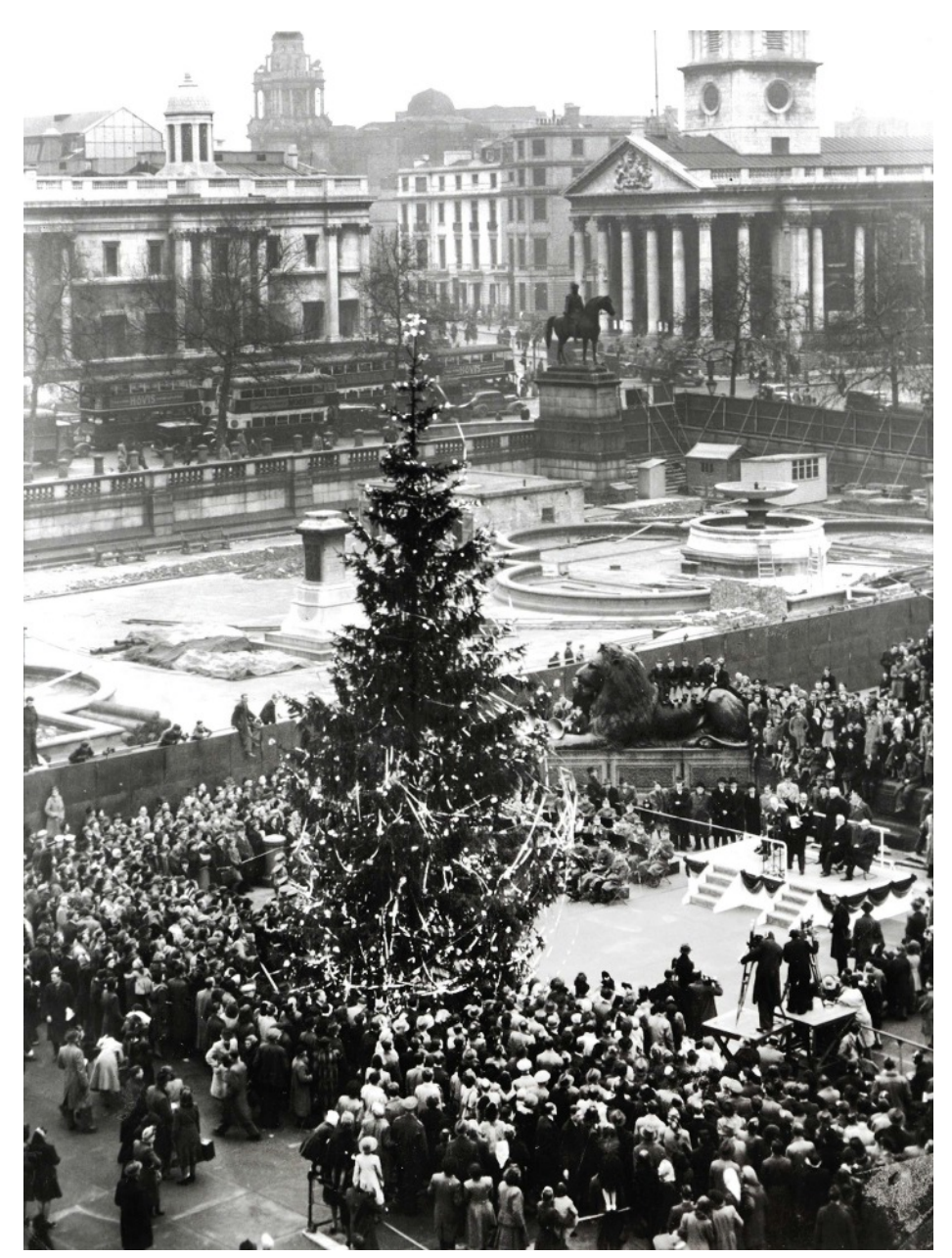
Photograph showing the first Christmas tree to be sent from the people of Oslo in Norway and displayed in Trafalgar Square in 1947. Now an annual tradition in recognition for the support given by the British to Norway during the Second World War