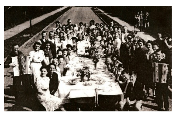
A Spondon Street Party

party. Yes the individual streets had parties, but everywhere, and everybody was in the party spirit. Where all the food and drink came from nobody knew or cared. There was not a lot of food or drink as we were rationed, but what there was, was good. All the mums and wives put on a wonderful spread in the circumstance.