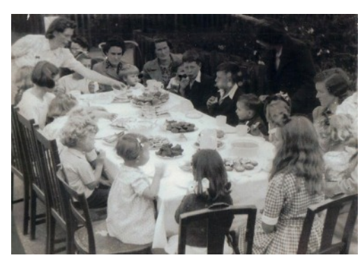
Another Spondon Street Party

Although the village in which I lived was close to Derby, and we did see action when the enemy tried to destroy the Rolls Royce factory, but nowhere near as bad as London, Coventry, Plymouth and other cities, I remember the anti aircraft guns up on the allotments, and afterward when they had been taken away, how us lads would play in the pits left behind, shooting down the enemy. In the centre of the village was a large static