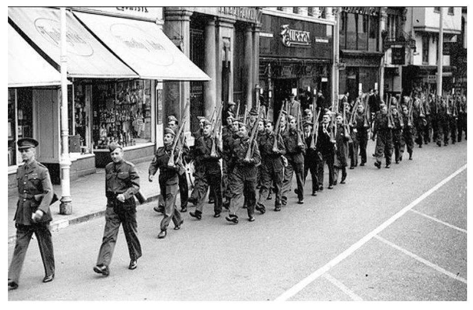
The local Home Guard (Dad's Army) parade through Hitchin Market Place

On VE Day and VJ Day Letchworth Garden City celebrated along with the rest of the country with street parties, singing and dancing. Many of those who had come to Letchworth to escape bombing elsewhere and to work in the factories chose to stay. A wonderful compliment for the town.