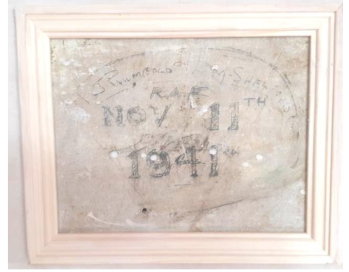
The wall painting with the letters R.A.F. & 1941 found in a home in Letchworth

The third and final incarnation of No.148 Squadron was as a special duties squadron, formed from the Special Liberator Flight (X Flight) at Gambut (Libya). This incarnation of the squadron used a wide range of aircraft, starting with the Consolidated Liberator but then adding the Handley Page Halifax, the Westland Lysander and even the Short Stirling for a month late in 1944. This version of the squadron carried out supply drops to resistance groups across the Balkans. After a move to Italy in January 1944 the squadon also began to carry out pick-up missions. The squadron was also used in an unsuccesful attempt to fly supplies to the besieged Poles in Warsaw (the flights themselves succesfully reached Warsaw and were amongst the longest combat missions flow during the war, but in the chaotic circumstances of the urban warfare inside Warsaw the Poles were unable to reach many of the supplies)..