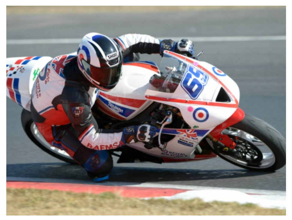
Royal Air Force Motorcycle Road Racing.

beer saw us complete a ride which had been 6 months in the planning. The event organisers would like to thank all who have donated, and who hosted the ride at the various venues, to the general public we met on the day. Perhaps for the 80<sup>th</sup> anniversary we might attempt an even bigger ride.