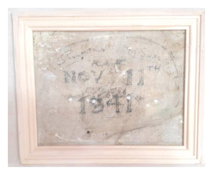
The wall painting with the letters R.A.F. & 1941 found in a home in Letchworth

I am hoping when times change and can get out and meet people, I will be able to report more. In the meantime if you thing you might be able to help with my enquiries, please contact me. Details on the second page.