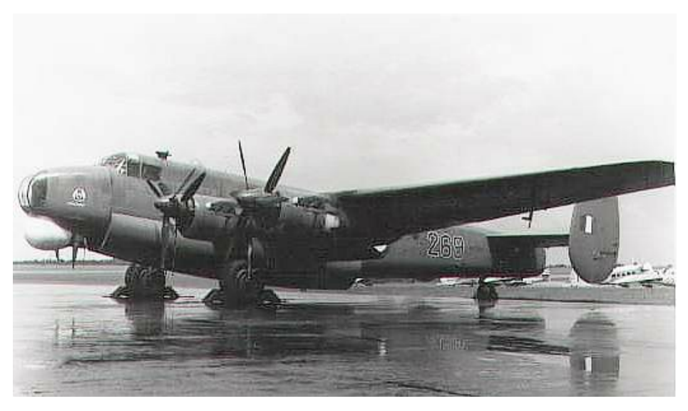
I couldn't find a Shackleton with the number 210 on the side, but my picture shows a Shakleton parked up at Ballykelly, number 269 - editor

Nothing else was heard of our trip to the seaside and my birthday treat passed into crew history.