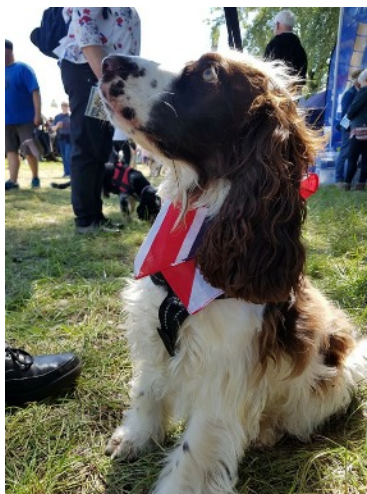
There were a lot of dogs walking around the show, wearing a union flag bandanna, purchased from the Branch stall, in aid of Branch funds.

Our cover pictures shows our stall neighbours getting steamed up.