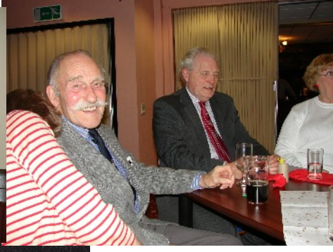
Enjoying himself at one of our 2008 Christmas party