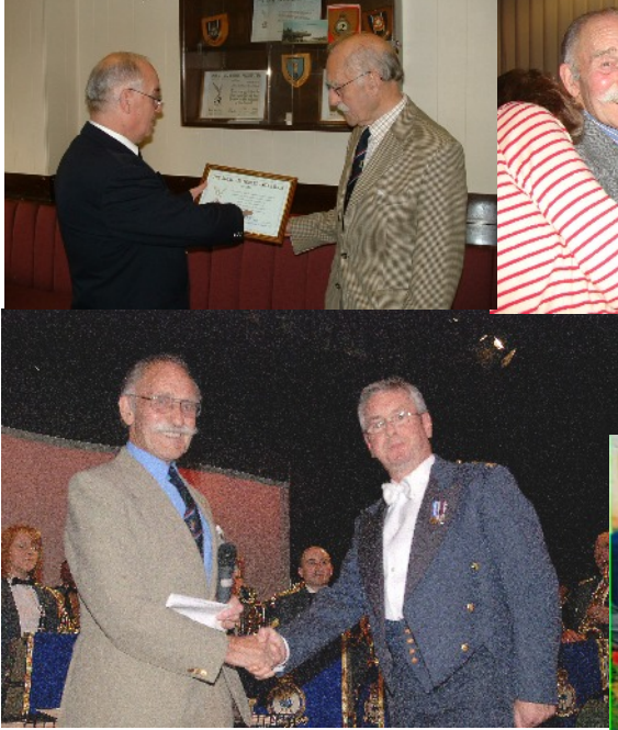
Thanking the Leader of the RAF Cromwell band after a performance in Letchworth for our Wings Appeal