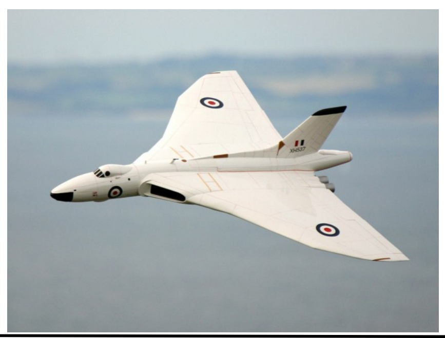
RAFAGEN is the official newsletter of the Letchworth Hitchin & District branch of The Royal Air Forces Association

There must be something there that has wetted your appetite. 2018 Diaries will be on sale from October 2017.